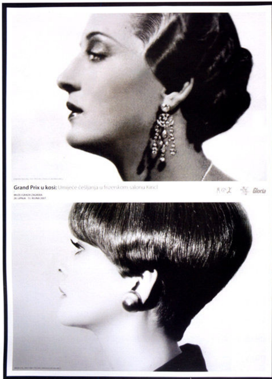
Grand Prix u kosi: Umijeće češljanja u frizerskom salonu Kinc!

Prof. Gjuro Szabo službeno je imenovan ravnateljem Gradskog muzeja. Osnovao je prvu fototeku te stručnu knjižnicu muzeja.