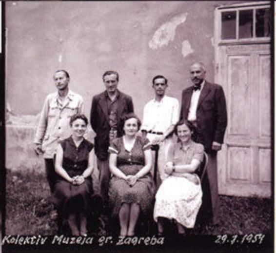
Kolektiv Muzeja gr. Zagreba 29. 7. 1954