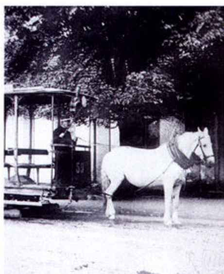
Korak do novog stoljeća

accessible both to professionals and to the general public. The experts of the museum's archaeology department started a series of research projects in localities within the historical urban nucleus of Zagreb.